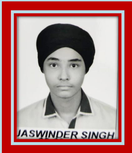
1 st Position