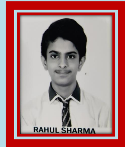
3 rd Position